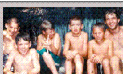
I am a Polar Bear... I am a Polar Bear... I am a Polar Bear

We are busy working on lining up staff for next summer. During the next couple of months we will be