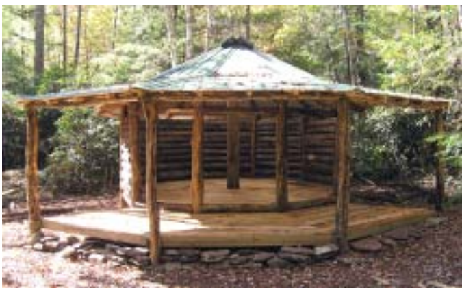
The New Shelter located at Still Oaks

This past summer we erected a new shelter down in the "Still Oaks" section of camp. The construction was part of our fairly new CT program. CT's are rising seniors who are part of a counsleor training program for boys aging out of the traditional camp program. This year's project was the shelter. The shelter will also serve as a memorial to former camper Alex Morrell who died in a plane crash in 2003.