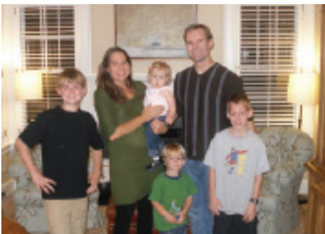
The Family Pool in Greensboro who braved some nasty weather, and make a mean latte.