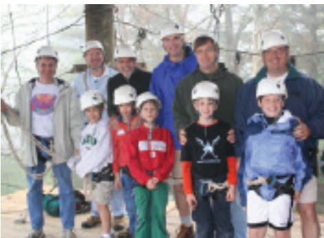
Father/son pairs preparing for the high ropes course.