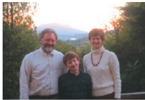
The McCallie's of Chattanooga who let me try a big bite of "hot leaf", unsuspectingly... It's like wasabi in lettuce form.