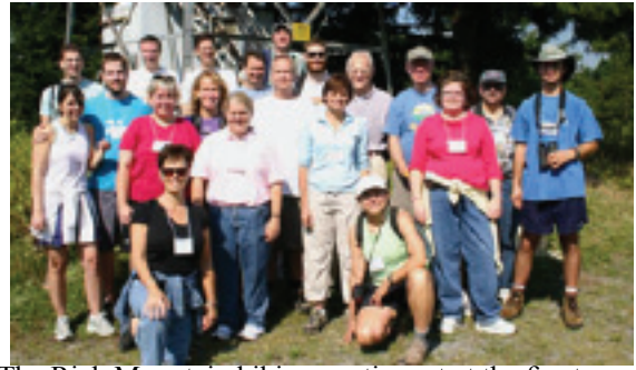
The Rich Mountain hiking contingent at the fire tower.