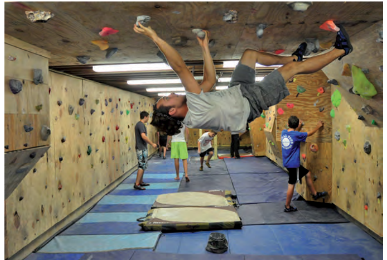
Our Bouldering Cave under the gym offers a great place to practice on rainy days or a cool escape in the afternoons.

great stories about what is happening at camp as well as all of those connected to camp. Send us your pictures and stories. We would love to do a spotlight on what is going on with you. Visit www.highrocks.com/news to read all the current and past posts from “Around the Rocks”.