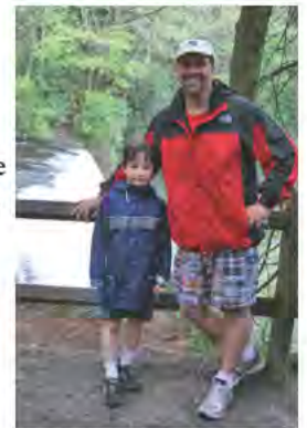
Father and son at Hooker Falls overlook, one of the many available in nearby Dupont State Forest.

Father-Son Weekend 2010 was a huge success and we are planning another one for May 13-15. It is a great opportunity for new families to get a taste of camp and spend the weekend enjoying the outdoors. Activities will include canoeing, hiking, climbing, ropes course, swimming, fishing, archery, riflery, tennis and a Saturday night campfire. The festivities will begin on Friday evening and go through Sunday lunchtime. We are looking forward to more good times and seeing all the new faces!