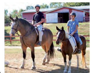
Buckwheat compared to Calico