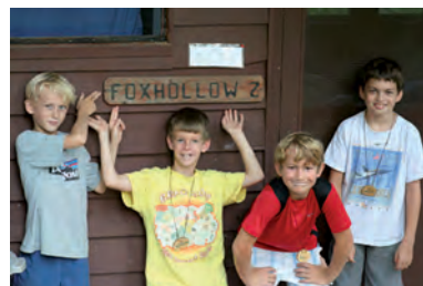
This is our house!

is a great experience for campers (and parents!) who would like to sample what camp has to offer while building a comfort level for living away from home. We currently have space in our Starter Camp for boys 7-10 years old but register now as spaces are filling up!