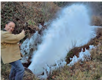
The draining flume was thirty feet long for 24 hours!

The lake was drained several feet over the winter to allow