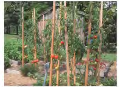
Nothing like a hand-picked tomato sandwich on a hot summer day

The Garden will be back in its third season with several notable improvements. It will remain next to the hiking porch, but we are increasing the size from six beds to nine. The beds will be protected with a permanent wooden fence rather than the chicken wire used previously. We also have a rain barrel installed under the gutters of the hiking porch, providing an easy way to water our plants without tapping into our well water. An exciting new element this year will be our compost bin; a three part system that will let us turn our vegetable and coffee leftovers into dirt to put back in the garden. As always, camper help and interest is very much appreciated. Last year saw a bumper crop of basil and other herbs, with tons of tomatoes, peppers, and squash which were all used in our delicious meals.