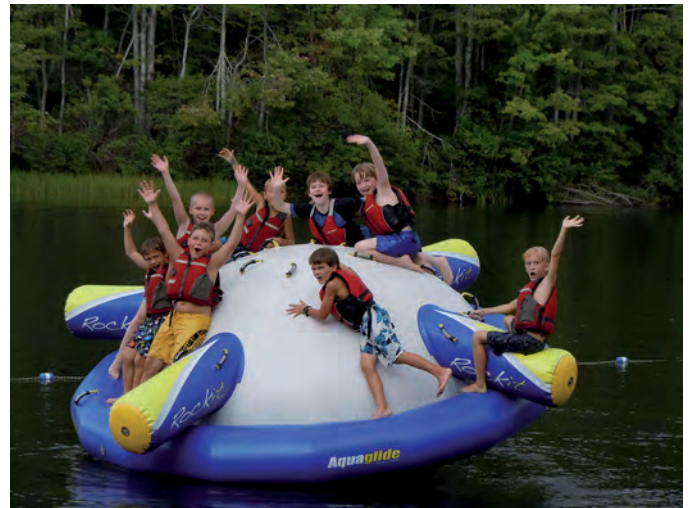
The Rock-It was a popular addition to the lake last summer

Our Starter Camp is an introductory one week experience built for a younger group of boys that are attending camp for the first time. Camper are exposed to a range of activities designed to spark their interest and enjoyment in each, but do not spend time building deeper skill levels as in the longer sessions. The week is packed full of activity rotations, special events, cabin overnights, and campfire. This