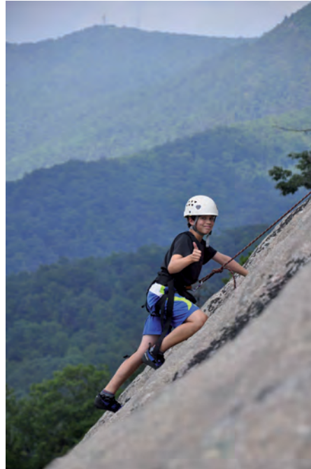
Campers can work their way onto trips all over the North Carolina mountains. From rivers and waterfalls, hiking and biking trails, and gorgeous rock faces, we do it all.