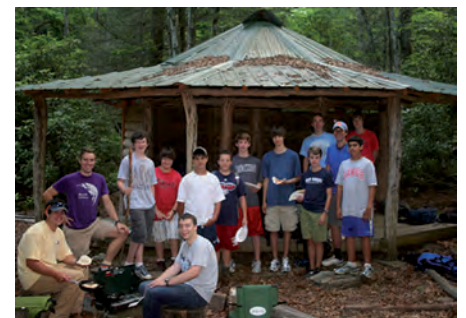
Cabin overnights open each session and are the first introduction into camping in the woods.

High Rocks can be found on Facebook! Check out pictures, lots of videos, catch up with old friends, and let us know what is happening in your life. This is a great way to share pictures and stories with us to pass along on our blog. Just search Camp High Rocks on Facebook. We have a couple group pages as well as a great “fan page.”