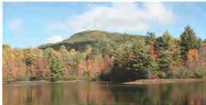
The view of Rich Mountain from the High Rocks lake. It is a focal point from nearly everywhere in camp and as such, it is great to have it preserved for High Rocks alumni and future campers alike.

Thanks go out to everyone that donated to this project! We will let you know as progress is made with this final purchase.