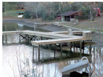
Plenty of room to work now