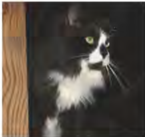
Captain Jack on the lookout

The barn also has two small critter additions that are just now getting used to their new home. Jack (named for an uncanny resemblance to Captain Jack Sparrow) and Gibbs (his trusty first mate) are rescued cats from town who have taken over the role