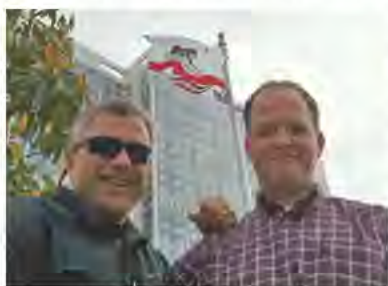
High Rocks enjoying southern California

It feels like we are going to have an early spring this year with the weather suddenly warming and groundhogs not seeing their shadows. After the second cold winter in as many years, no one at camp is complaining! The snow has melted, the sun is out, and camp seems to have come to life after hibernating through