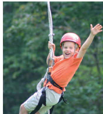
Fun on the zipline!! Everyone gets an opportunity to participate in the ropes course and zipping.

Our Starter Camp is an introductory one week experience built for a younger group of boys that are attending camp for the first time. Camper are exposed to a range of activities designed to spark their interest and enjoyment in each, but do not spend time building deeper skill levels as in the longer sessions. The week is packed full of activity rotations, special events, cabin overnights, and campfire. This