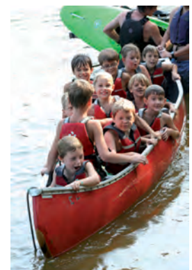
Operation: Stay Afloat The strategy is be absolutely still... thus the

is a great experience for campers (and parents!) who would like to sample what camp has to offer while building a comfort level for living away from home. We currently have space in our Starter Camp for boys 7-10 years old but register now as spaces are filling up!