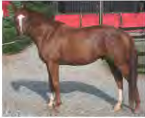
Top: Truman striking a pose R: Johnny is young and

himself! The most recent arrival to camp is Johnny, a paint who enjoys getting out on trail rides and absolutely loves jumping.