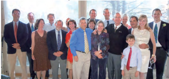
Top: Generations of High Rocks at the wedding