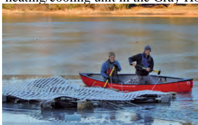
Sledgehammer canoeing is the new workout this summer

While the lake remained low we also put a geothermal heating/cooling unit in the Gray House, a project that could not happen fast enough with the freezing temperatures at the time. We had to bust through 3-4 inches of ice on the lake in order to sink the apparatus in about 12 feet of water. This depth was key in order to maintain a constant water temperature year-round for the system which even now