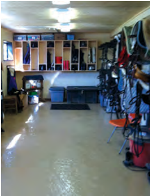
There are several mystery ponies painted in the tack-room. Let's see who can find them all!

The barn is the site of more off-season projects for campers and staff to enjoy this year. It began with gutting the tack room from the ceiling down to acid-washing the floor. Here is the new setup that riders have to look forward to this summer; it looks straight out of Churchill Downs! New cubbies, saddles racks, and jumps were also built for the riding program. There is even a new carrot garden to provide treats for a favorite