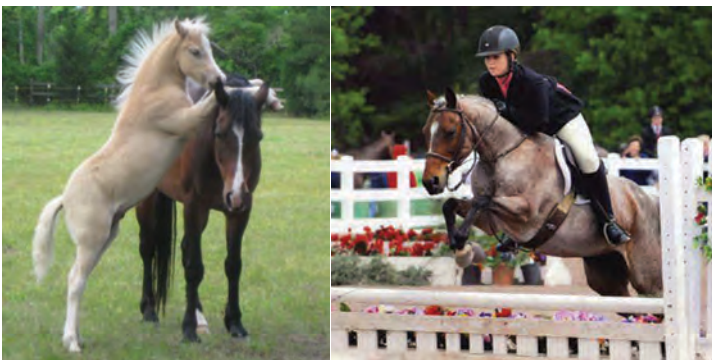
Willow with her one of her foals and Cappuccino showing off over a jump. Both will be exciting additions this season!