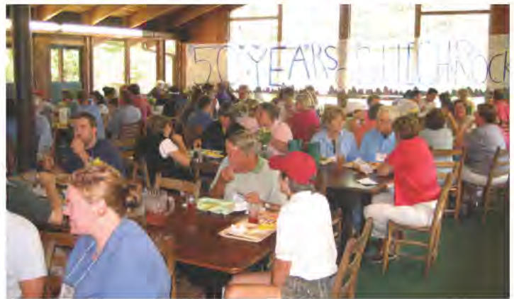
The 50th reunion was a huge success and we are hoping for even more alumni this September! Reserve your spot soon!

For more information and to register, please go to the Alumni section of our website. See you in September!!