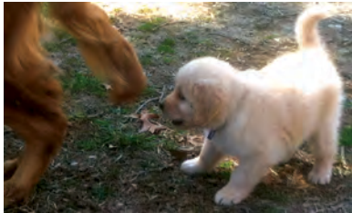
The end of this tail needs no telling.

The weather continued to be so mild that it was time to get back outside and tackle some other projects around camp. With roughly a thousand acres of deciduous forest, trees require our constant attention and maintenance. Over the space of several months, the three guys removed dead/dying trees throughout main camp before they could become hazards. The shoreline by the fishing dock was opened up all the way down to the bridge by John Carpenter using ropes and a harness to trim branches up to about twelve feet; plenty of room for some overhead casting. Once all the work removing trees was finished, the focus shifted on planting new ones for the future. Elm, sugar maple, and blue spruce trees were planted all around camp and will be providing shade for thousands of future campers. Outside of main camp, our network of trails runs for miles and crosses many streams on