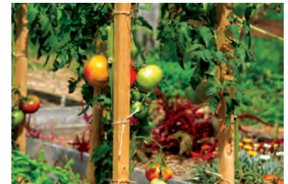
Mortgage Lifters, Green Zebras, and Cherokee Purples are some of the delicious tomatoes grown!

The early warmth has made it possible to plant some cold-hardy vegetables like spinach, rainbow chard, kale and buttercrunch lettuce to supplement the herbs already growing. Even the catnip is coming back strong and will once again be a popular stop for campers on their way to riding with hopes of befriending the barn cats. Brussels sprouts grew all winter, but to the relief of many a High Rocker, will die soon in favor of summer crops. Our usual heirloom tomatoes, hot peppers, squash, edamame, and melons will all be back.