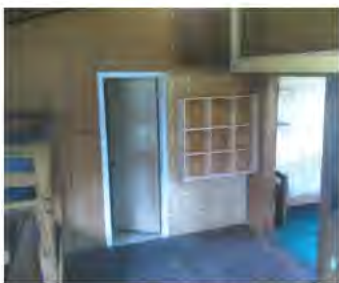
Halfway II's new shelves, walls and bathroom will make it a favorite summer location.